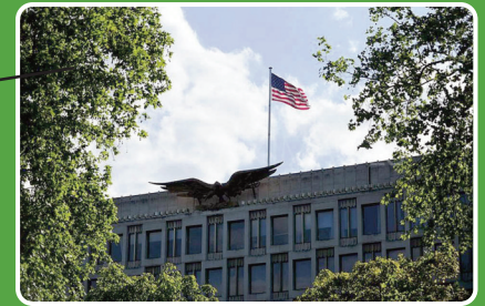
U.S Embassy, Grosvenor Square