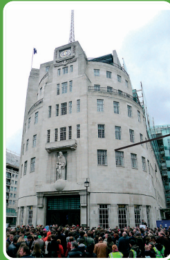
Portland Place near BBC Radio